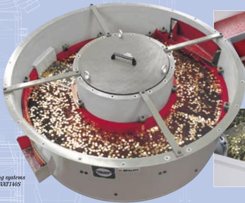
Hot Air drying systems VAT540S and VAT140S